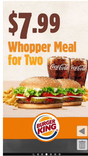
Full Screen Ad entices customers to your location