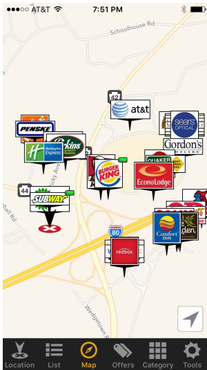
Your Logo pinned at location coordinates. A special tag if offers exist at that location.